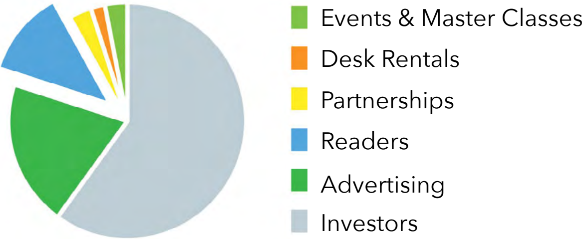
Reader Gifts as % of Total Revenue

And our freelance reporting budget increased by 37%.